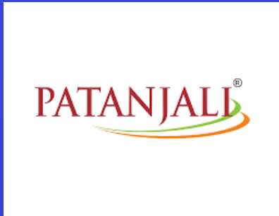
Patanjali Ayurved limited