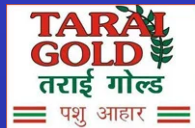
Universal industries, Kashipur